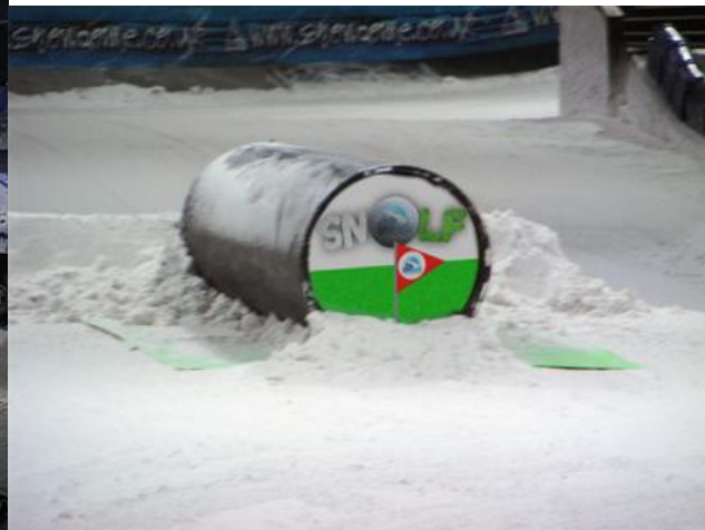
The Gas Pipe for Snolf