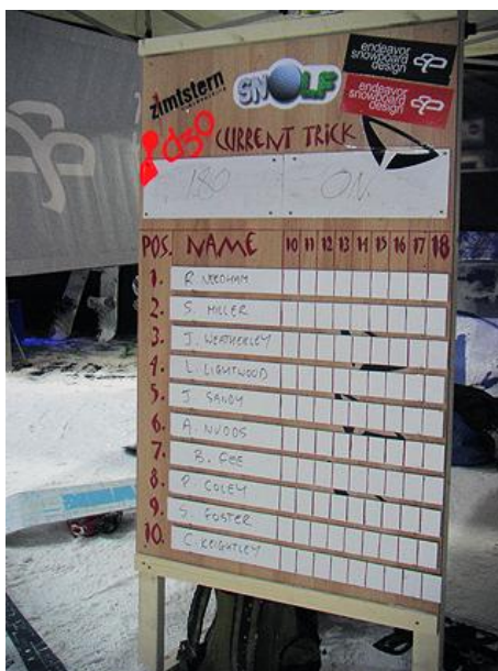
The SNOLF Scoreboard